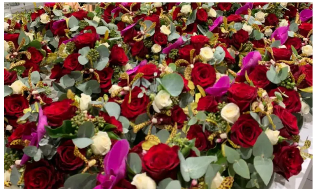
Flowers ready for delivery

Guests were asked to dress in red or blue – the colours of the Cambodian flag. Finally, after months of planning, an amazing 217 tickets had been sold to the event and the stage was set for a fun evening in support of Cambodian women and children.