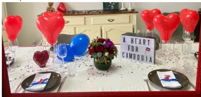
Table decorated at host's home