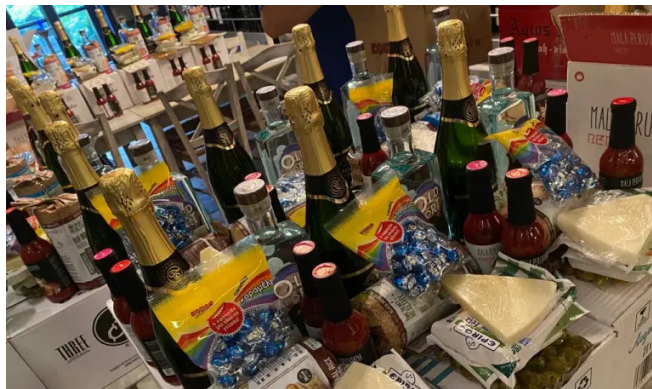
Food packages for each host

A team of volunteers drove around Singapore, delivering everything hosts needed to create a gala experience at home. Along with table decorations, balloons and beautifully arranged flowers from Dan Takeda Flower and Design, hosts received a delicious Greek food package from Blu Kouzina Restaurant. TTG Wines provided specially selected sparkling, red and white wines.