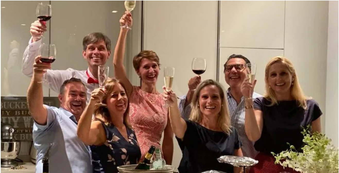
One household of Heart for Cambodia guests

2020 posed some unique challenges for fundraisers, but that didn't stop the volunteers of First Hand from throwing a great party. Instead of one large gala, this year's event moved to 37 homes across the island. Each host invited up to 5 guests (as per Singapore Covid guidelines) and each host even had their own safe entry code.